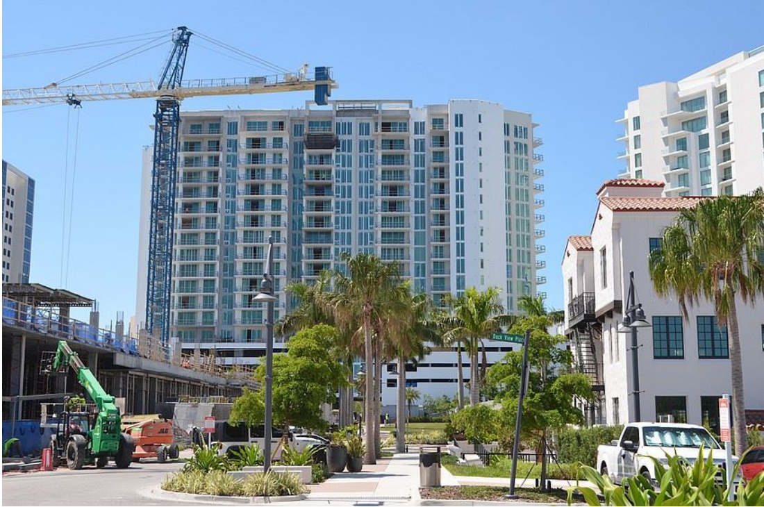
Luxury condominium tower Bayso nears completion at The Quay.

Downtown luxury condo supply remains shy of demand Although more than 600 units are planned or under development in Sarasota, the influx of buyers from across the country, many of them paying cash, still outpaces development. Who are all the buyers for these homes, where are they coming from, and are there enough to sustain the current pace of development? READ FULL ARTICLE .